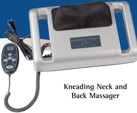
Kneading Neck and Back Massager